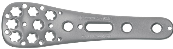
item no. 5.790.84

8 head holes, for screws 3.5/4.0 mm, small fragment, titanium, complete set item no. 19.3673.00